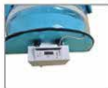
Negative Generation System